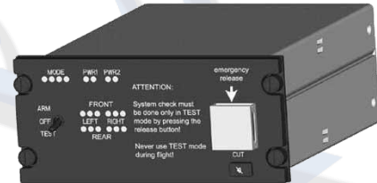
Cockpit mounted electronic control box for pyroelectric emergency release system